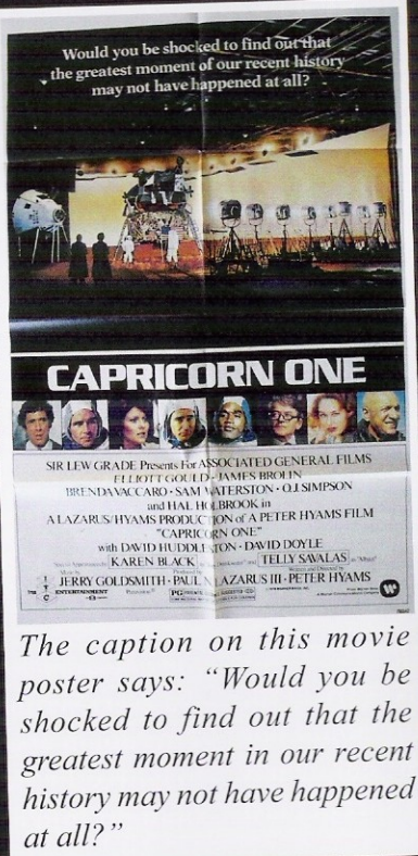
The caption on this movie poster says: "Would you be shocked to find out that the greatest moment in our recent history may not have happened at all?"